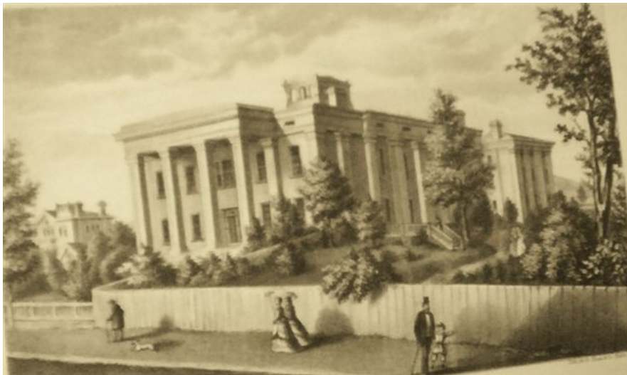
Pictured above Virginia Female Institute circa 1875, courtesy of Stuart Hall (formerly VFI) Lynchburg, Virginia