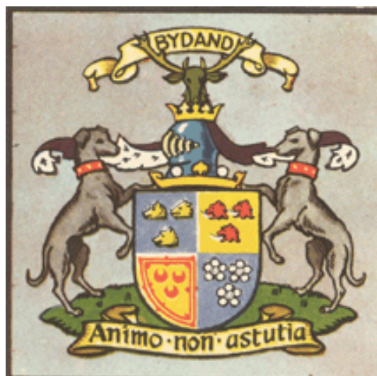
Arms of the Marquis of Huntly, Chief of the Gordons