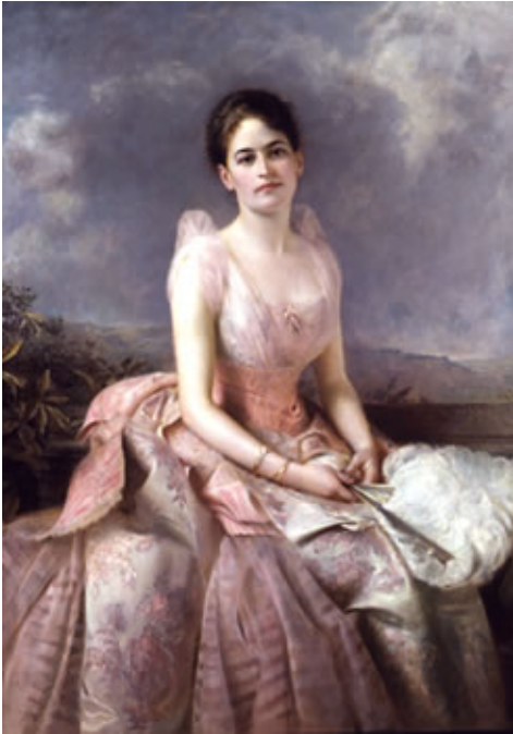
Juliette Gordon Low 1887

Daisy Gordon has arguably been the most significant influence on girls in the USA ever. The founder of the Girl Scouts of America, an organization which has grown from 18 girls to over 3.7 million today, Daisy and her organization has impacted more than 50 million girls, women (and even a few men) who have belonged to it.